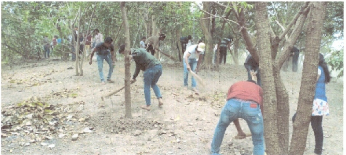
One Day Cleaning Activity in Mouje Umalwad Village by NSS Volunteers