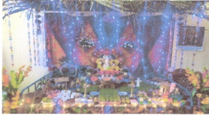
Winner Number 01