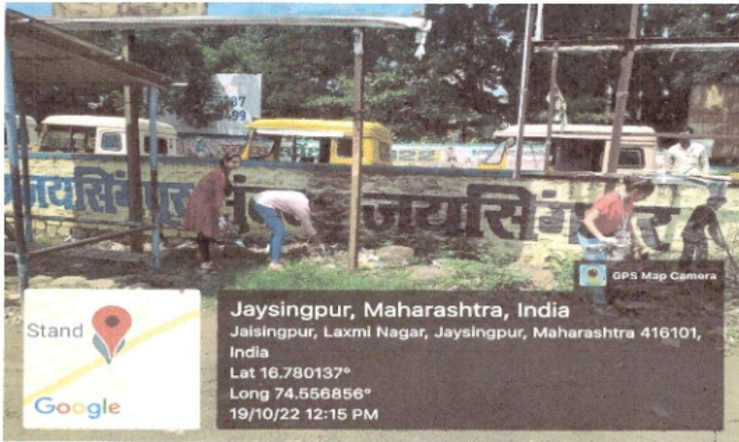
Plastic Collection campaign at ST Stand area of Jaysingpur City