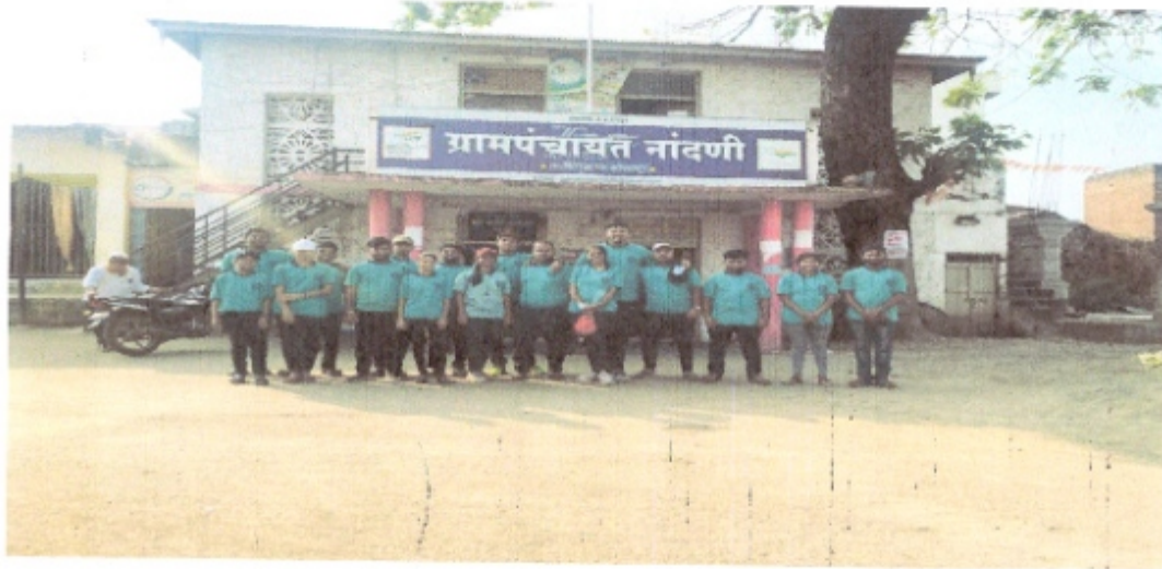
One day Cleaning Camp at Nandani Tal-Shirol by NSS Volunteers