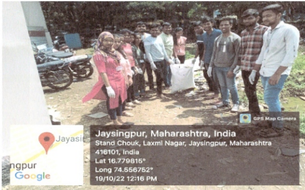
Collection of Plastic in Market Area