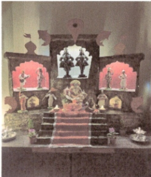
Winner No: 02