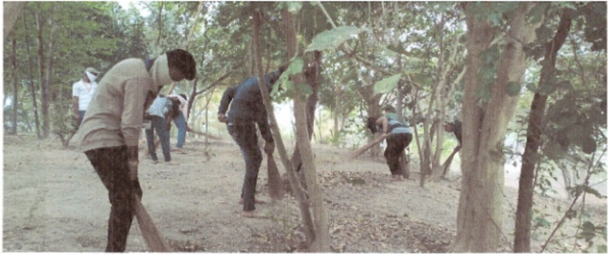
One Day Cleaning Activity in Mouje Umalwad Village by NSS Volunteers