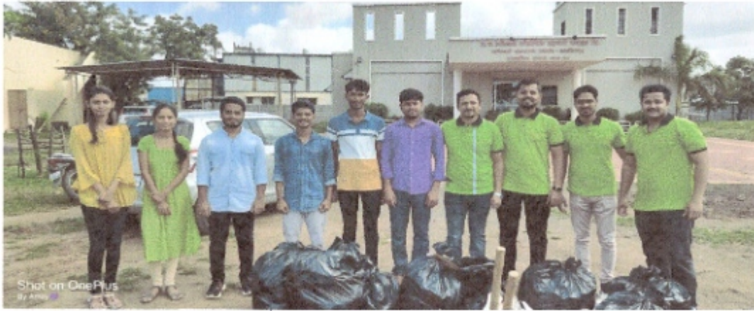
Plastic collection in Akiwate Industrial Estate Area by NSS Volunteers

P.A. Ch Programme Officer NSS Unit Dr. J.J. Magdum College of Engg. Jaysingpur.