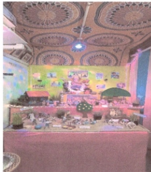
Winner No: 03