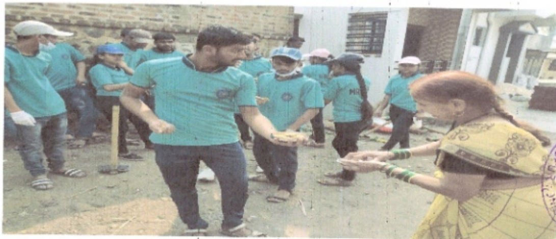
Villagers helping to NSS Volunteers

P.A.M. Programme Officer NSS Unit Dr. J.J. Magdum College of Engg. Jaysingpur.