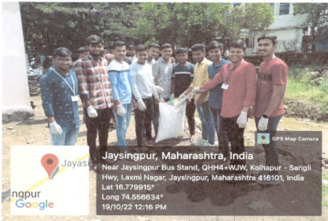
Collection of Plastic in S.T.Stand Area